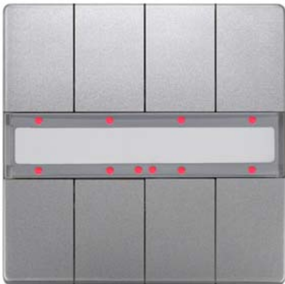
GAMMA INSTABUS WALL SWITCH QUADRUPLE, WITH LED UP 287/3 DELTA STYLE PLATINUM METALLIC