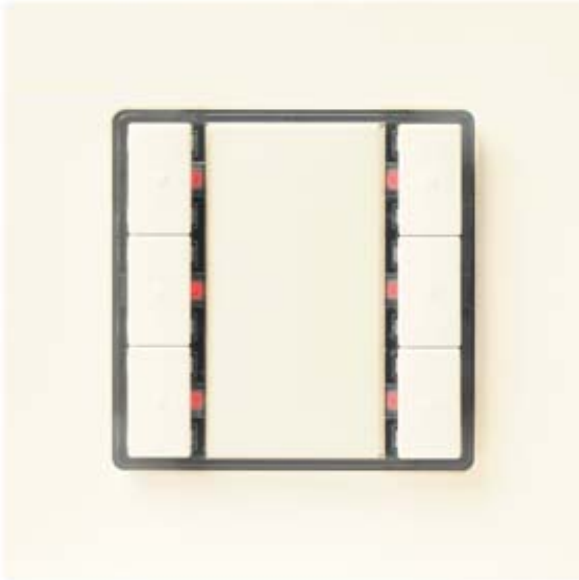
WALL SWITCH TRIPLE, WITH LED AND TEMPERATURE SENSOR UP 223/4 DELTA I-SYSTEM TITANIUM WHITE