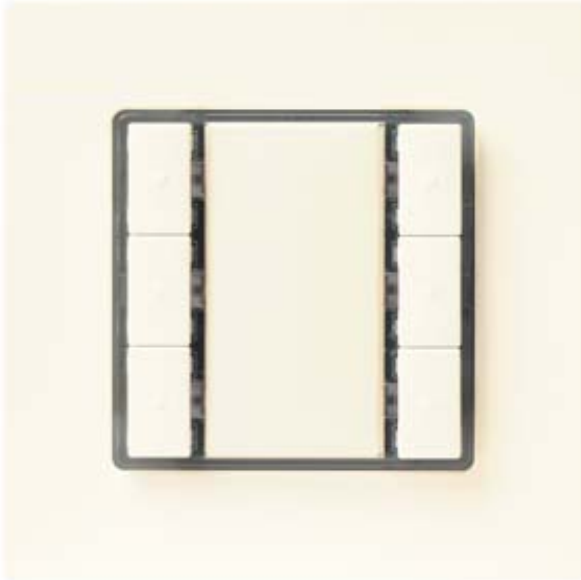
GAMMA INSTABUS WALL SWITCH TRIPLE UP 223/2 DELTA I-SYSTEM TITANIUM WHITE