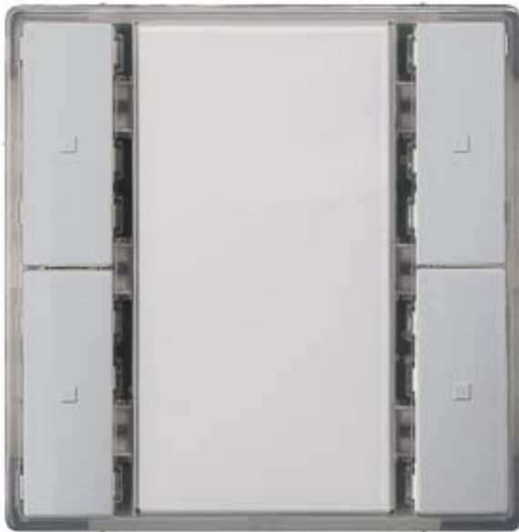
GAMMA INSTABUS WALL SWITCH DOUBLE UP 222/2 DELTA I-SYSTEM ALUMINIUM METALLIC